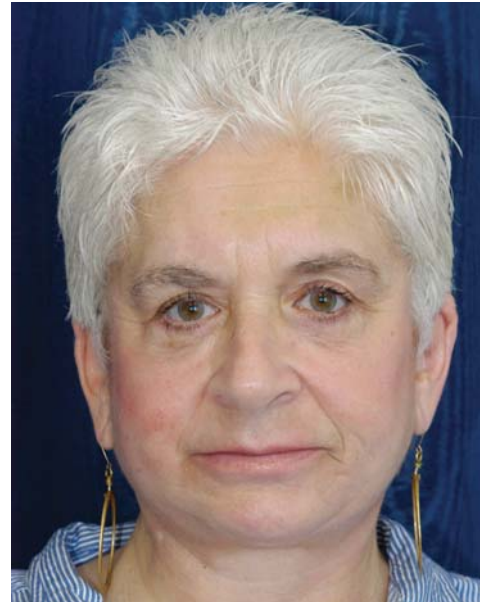
Today's plastic surgery procedures can yield subtle or dramatic results.

who can choose just to have the neck and jowls done, for example.