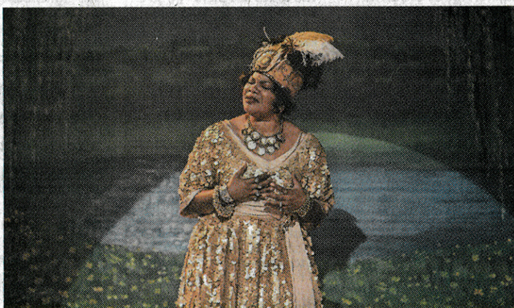
Mo'Nique appears as Ma Rainey in the HBO film "Bessie."